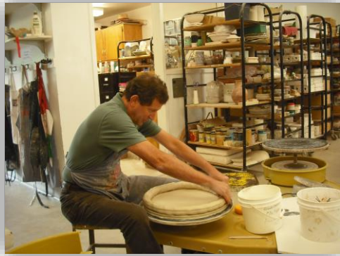
Pressing a clay ring to the vessel bottom