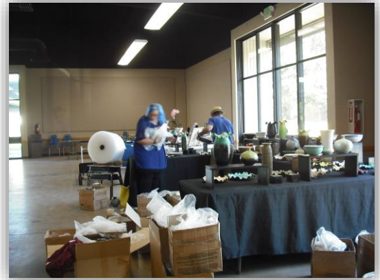
Time to Set Up