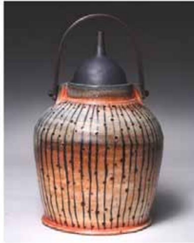
Industrial Temple Jar soda fired stoneware, bronze lid, copper handle, found parts, 2010

Gift from Richard Burkett for attendees of his upcoming October 4-5th workshop—a free copy of his glazing software, HyperGlaze! There are a few seats available. See P. 7 for application.